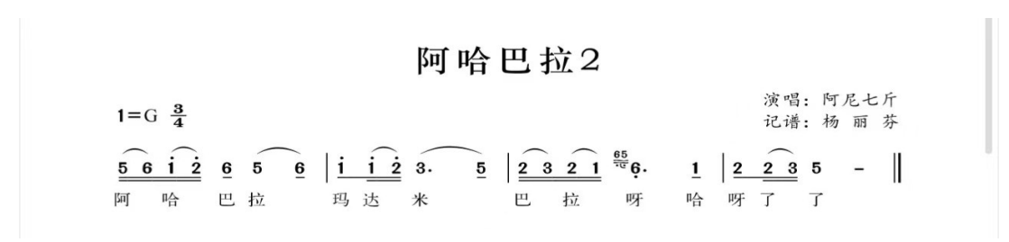
Figure 6: Song Score 6, Ahabala 2; Performer: Ahni Qijin; Composition: Yang Lifen

Songs that express feelings about family and friendship, especially Mosuo folk songs singing about the mother, are particularly abundant. The reason for so many songs about mothers is that Mosuo families are matrilineal. Accordingly, there are many symbols of the mother-venerating culture for Mosuo people. There are as many songs about mothers as hairs on a cow. One tune can be paired with lyrics with many different emotions. The Ahabala melody offers an example (cf. Yang 2018) (see Figures 4 and 6).